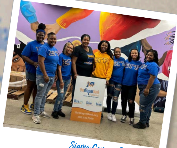
Sigma Gamma Rho Sorority