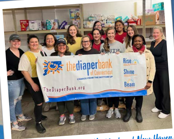
Junior League of Hartford and New Haven