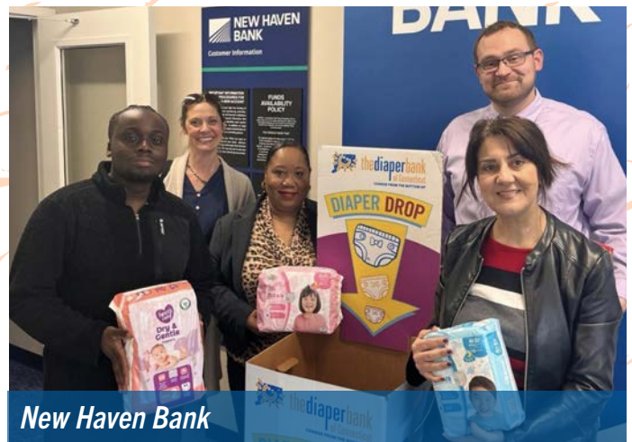
New Haven Bank