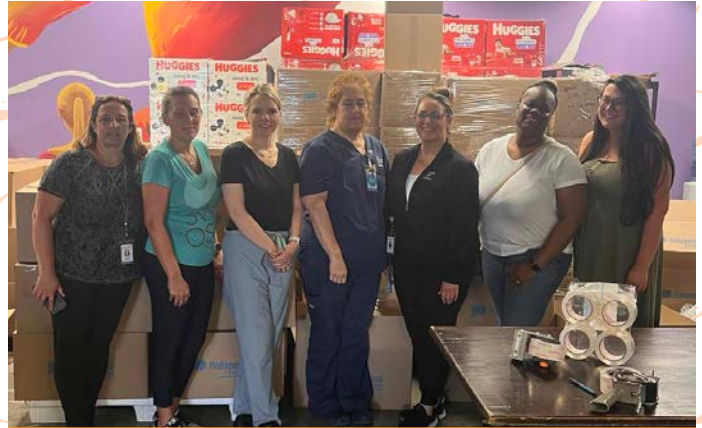
North East Medical Group