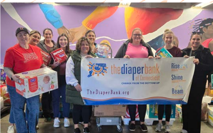
Junior League of Hartford